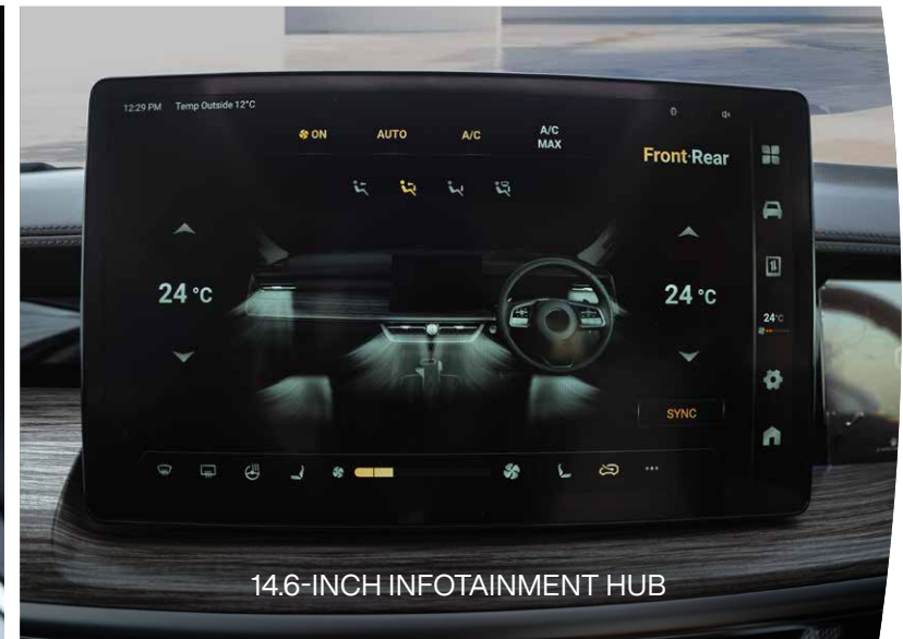
14.6-INCH INFOTAINMENT HUB